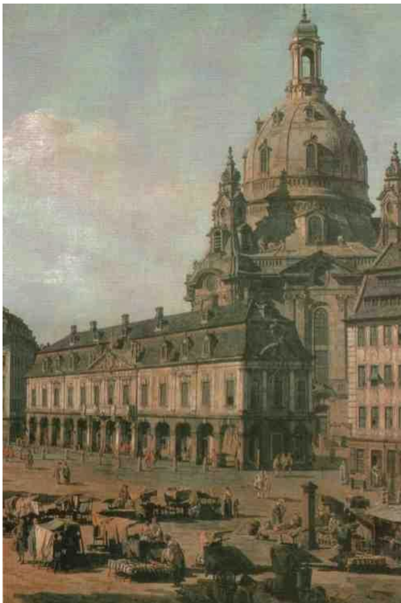
“The Neumarkt in Dresden from Moritzstraße” (Detail from Canaletto's painting )

“Finally the fields of Dresden appeared before us, in the rich countryside the river shining in the morning sun, the sweet smelling city with its towers, glittering...” (Ernst Rietschel, 1804 – 1861)