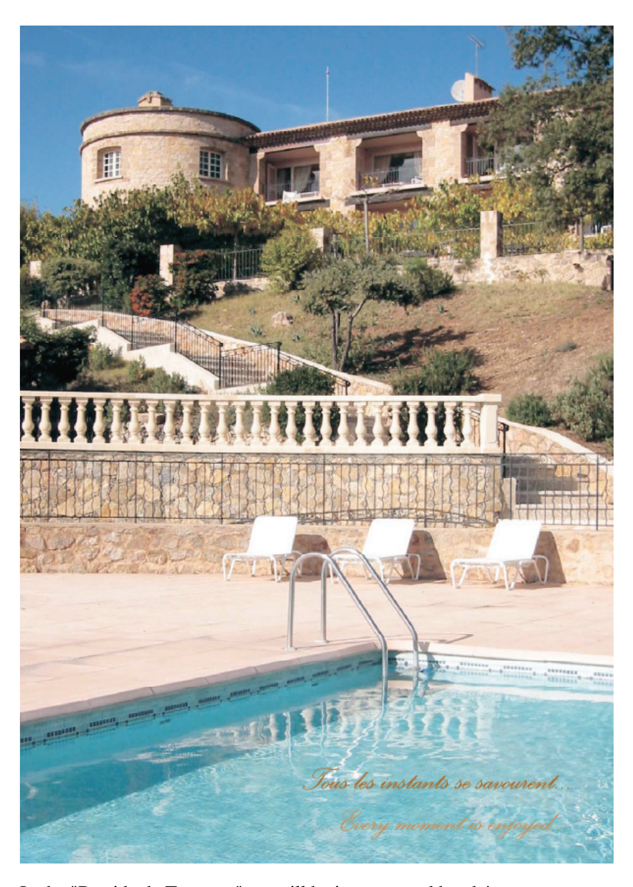
In the "Bastide de Tourtour" we will be in very good hands!