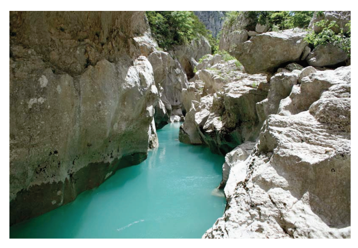
Fly-In 2012 Alpes de Haute Provence 21st- 24th June 2012

Europe's largest canyon will enchant us - Les Gorges du Verdon! But, of course, not just the impressive water and the spectacular gorge and all it has to offer.